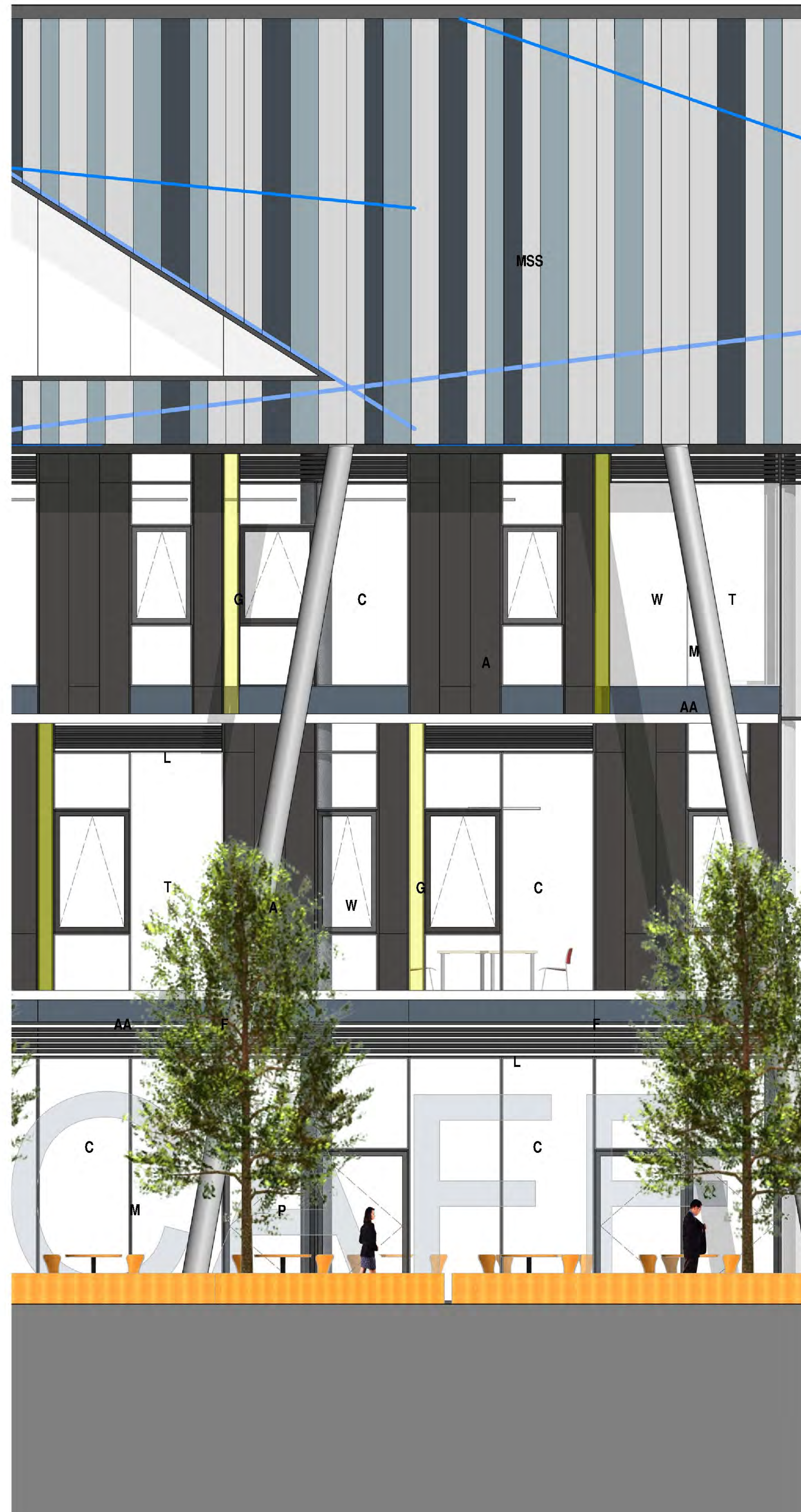
1 WEST ELEVATION - TYPICAL PORTION 1 : 50